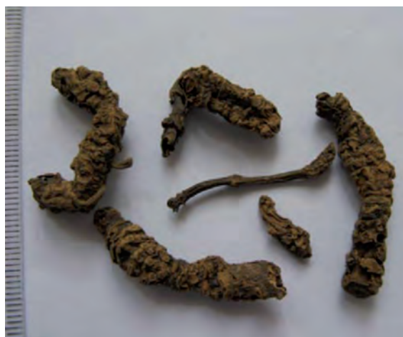
Figure 1. Morphology of Doronicum scorpioides roots.

Solutions of 5 mg/ml of different fractions were prepared and 10 µl of them were applied to the silica gel plated 60 F 254 (10×20 cm) from Merck With 5 µl graduated micropipettes from CAMAG. The plates were run in nonpolar (toluene: acetone, 80:20), semi polar (toluene: chloroform: acetone, 40:25:35) and polar (n-butanol: glacial acetic acid: water, 50:10:40) mobile phases. Chromatographic spots were visualized first using ultraviolet